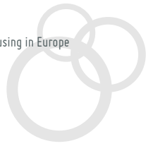
Table 3 Random intercept model predicting the likelihood of housing deprivation for owners